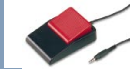
FS-20 Foot Switch