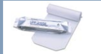
UPP-210SE High Quality Printing Paper