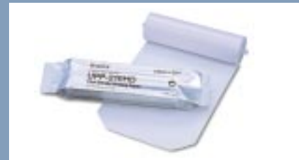
UPP-210HD High Density Printing Paper