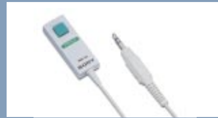
RM-91 Remote Control Unit