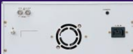
UP-980 Rear Panel