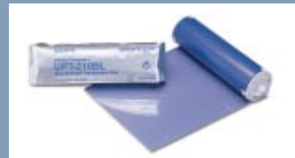
UPT-210BL Blue Transparent Film