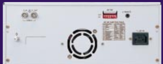
UP-960 Rear Panel