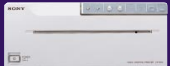
UP-960 Front Panel