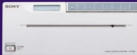
UP-980 Front Panel